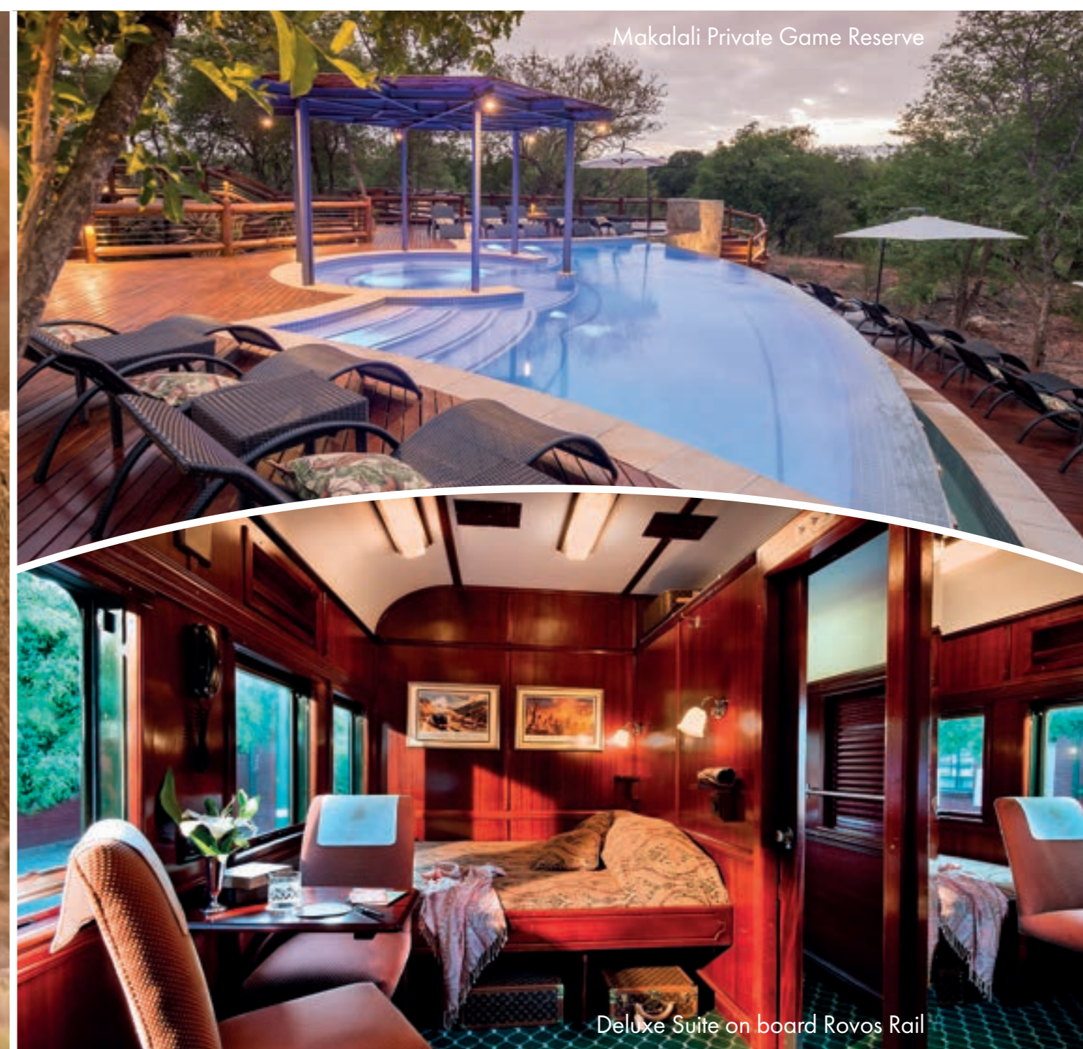
Makalali Private Game Reserve